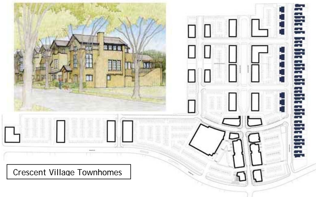
Crescent Village Townhomes